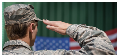
17- WRS Judicial Pension Plan Handbook